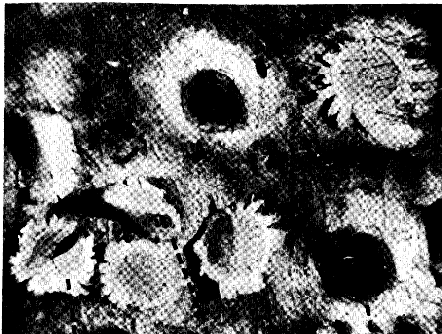
FIG. 2 A B C

NYMPHS OF CEROPSYLLA SIDEROXYLI RILEY. A-- SPLIT NYMPHAL SKIN, ADULT READY TO EMERGE. B-- EMPTY NYMPHAL SKIN, ADULT EMERGED AND GONE. C-- PIT VACATED BY NYMPH.