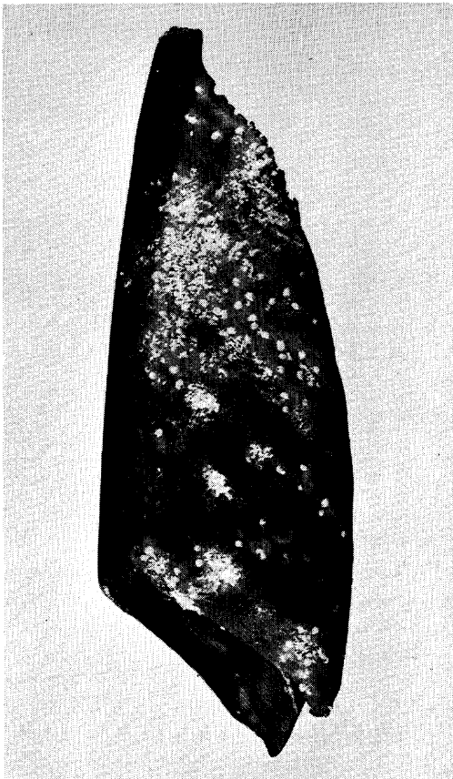
FIG. 3: OLEANDER SCALE ON BIRD-OF-PARADISE. SLIGHTLY REDUCED.

DISTRIBUTION IN FLORIDA: ALACHUA, BREVARD, BROWARD, CITRUS, CLAY, DADE, DE SOTO, DUVAL, GADSDEN, HILLSBOROUGH, INDIAN RIVER, JACKSON, JEFFERSON, LAKE, LEE, LEON, MANATEE, MARION, ORANGE, OSCEOLA, PALM BEACH, PASCO, POLK, ST. LUCIE, SANTA ROSA, SEMINOLE, AND VOLUSIA COUNTIES (FIG. 4).