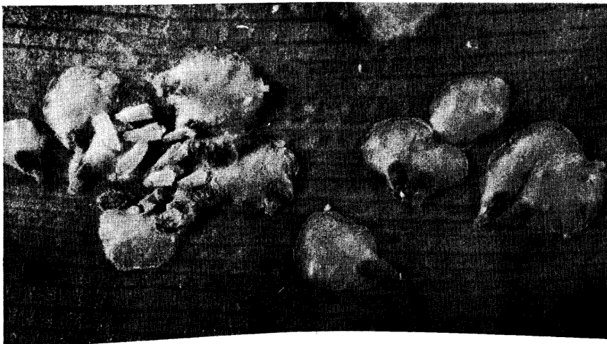
FIG. 1: PEAR SHAPED FEMALE OLEANDER SCALE ON LEAF OF BIRD-OF-PARADISE WITH MALE SCALE (X10).

CONTROL: DIMETHOATE (CYGON) 25% EC AT 1/4 PINT TO 12 1/2 GALLONS OF WATER, OR ETHION 46% EC AT 1/8 PINT PLUS 1/2 PINT OIL EMULSION 80-90% TO 12 1/2 GALLONS OF WATER, OR MALATHION 57% EC AT 1/4 PINT TO 12 1/2 GALLONS OF WATER. CYGON HAS CAUSED INJURY TO SOME OF THE ORNAMENTALS LISTED, ESPECIALLY BURFORD HOLLY. IF CONTROL IS NEEDED FOR FRUIT TREES, CONTACT YOUR COUNTY AGENT. READ AND HEED LIMITATIONS AND PRECAUTIONS GIVEN ON MANUFACTURERS' LABELS.