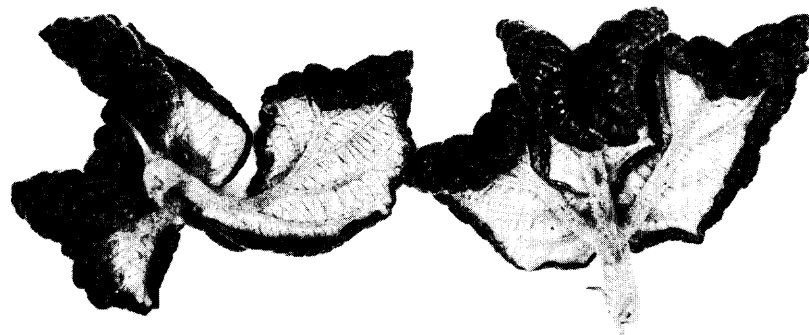
INTERMEDIATE DAMAGE TO YOUNG BLACKBERRY LEAVES BY THE BLACKBERRY PSYLLID.