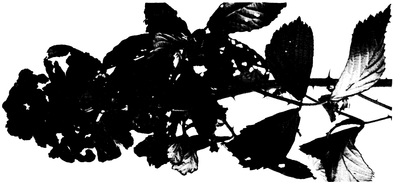
DAMAGE TO WILD BLACKBERRY BY THE BLACKBERRY PSYLLID. NORMAL LEAVES TO THE RIGHT; STUNTED AND DISTORTED LEAVES TO THE LEFT AT THE TERMINAL END OF THE CANE.

SYMPTOMS: THE BLACKBERRY PSYLLID CURLS AND STUNTS THE GROWTH OF NEW, RAPIDLY GROWING SHOOTS AND LEAVES OF WILD AND CULTIVATED BLACKBERRIES (FIG. 1 AND 2). EARLY IN THE SEASON THE INJURED TISSUE, PARTICULARLY THE LEAVES, IS USUALLY A MUCH DARKER GREEN, WHILE LATER IN THE SEASON DISTORTED NEW GROWTH MAY HAVE A NORMAL GREEN COLOR. ADULTS MAY ALSO ATTACK NEW FRUIT SPURS BEARING FRUIT BUDS, STUNTING THE FRUIT BUDS' GROWTH. THE INJURED SHOOTS NEVER BEAR NORMAL, WELL DEVELOPED BERRIES.