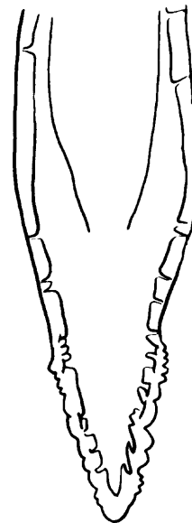
FIG. 3. OVIPOSITOR TIP OF ANASTREPHA SUSPENS A (LOEW).