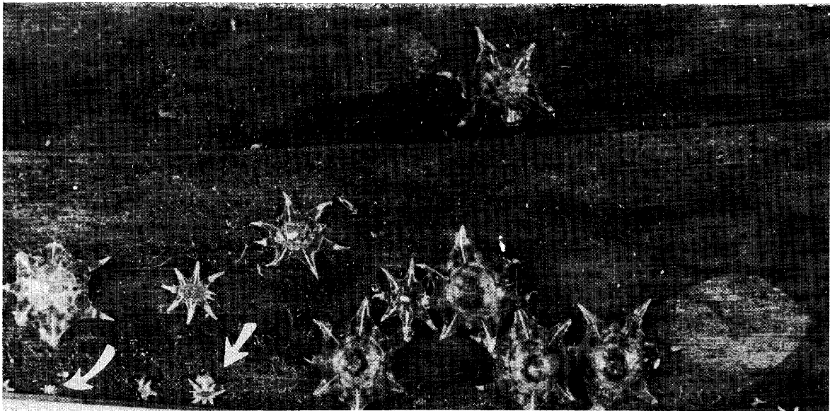
FIG. 1: STELLATE SCALE ( VINSONIA STELLIFERA (WESTW.)) (X6). ARROWS POINT TO NYMPHS.

DESCRIPTION: THE ADULT SOFT SCALE IS STAR-SHAPED AND COVERED BY A THIN, TRANSPARENT WAXY SECRETION (FIG. 1). THE ADULT FEMALE MEASURES 3.5 TO 4.5 MM ACROSS THE MEDIAN RAY. ONE AUTHOR DESCRIBES THE SCALE AS "RESEMBLING A TENT PEGGED DOWN IN SIX OR SEVEN PLACES" 2/ ; ANOTHER DESCRIBES ITS APPEARANCE AS BEING MUCH LIKE THAT OF AN IMMATURE STARFISH. THE COLOR OF THE LIVING INSECT IS PINK TO PURPLISH-RED WHICH DARKENS WITH AGE TO A REDDISH BROWN.