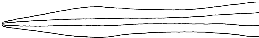
FIG. 2. OVIPOSITOR TIP OF DACUS CILIATUS (LOEW)