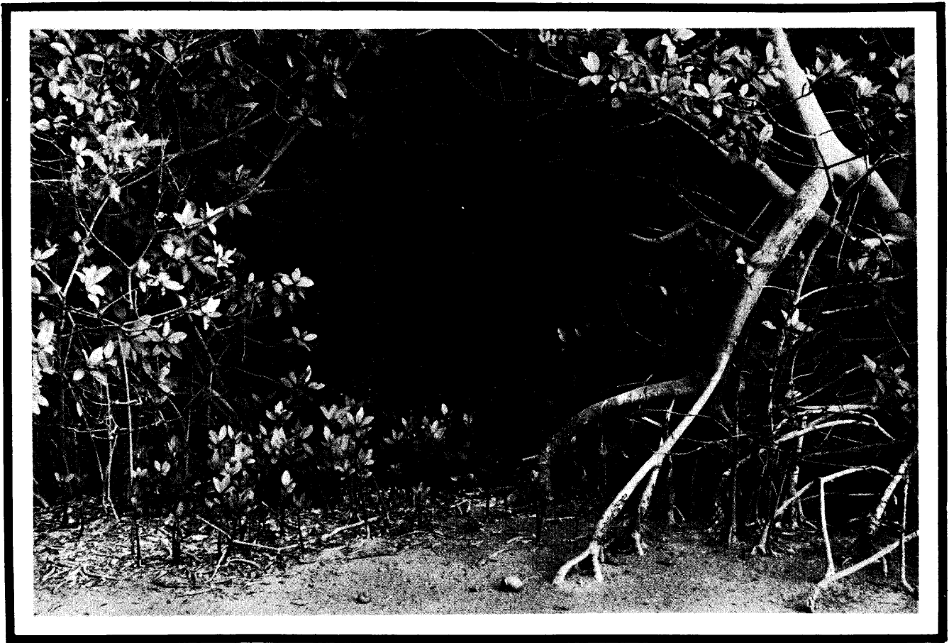
FIG. 5--TYPICAL RED MANGROVE GROWTH HABITS IN BRACKISH COASTAL SITUATIONS IN SOUTH FLORIDA; SEEDLINGS IN MUD OF FOREGROUND; AERIAL ROOTS HANGING IN BACKGROUND.

TAXONOMY: IT WAS ORIGINALLY DESCRIBED AS THE TYPE OF THE MONOTYPIC GENUS SPERMATOPLEX (HOPKINS 1915: 48). SCHEDL (1952:160-161) STATED THAT IT BELONGED IN THE GENUS POECILIPS AND THAT THE P. RHIZOPHORAE EGGERS (1923:149) WAS A SYNONYM.