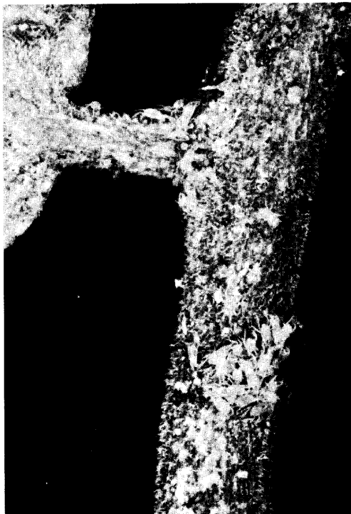
FIG. 2. CLUSTER OF MITES ON TOMATO STALK.