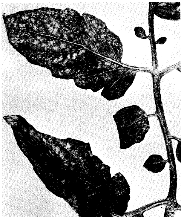
FIG. 1. CHLOROTIC DAMAGE CAUSED BY MITE FEEDING ON TOMATO LEAVES.

DESCRIPTION: THE BODY OF THE FEMALE IS ABOUT 400 \mu LONG, IS ELLIPTICAL WITH 26 DORSAL SETAE WELL DEVELOPED AND LONGER THAN THE INTERVAL TO BASE OF NEXT POSTERIOR SETAE. THE MALE IS ABOUT 340 \mu LONG WITH THE ANAL END TAPERING. SINCE THE FEMALE LOOKS SUPERFICIALLY LIKE MOST OTHER FEMALES OF THE GENUS TETRANYCHUS , IT WILL NOT BE ILLUSTRATED. THE MALE AEDEAGUS (FIG. 3) IS DIAGNOSTIC AND CAN BE USED TO SEPARATE THIS MITE FROM OTHER CLOSELY RELATED SPECIES.