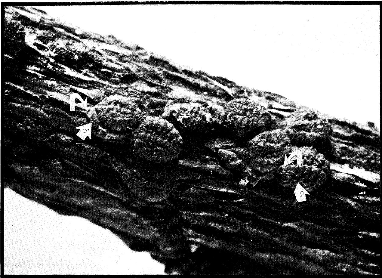
FIG. 1. GRENADE SCALE ON HIBISCUS STEM (X16); FEMALE (♀) AND MALE (♂). CURVED ARROWS POINT TO FLAP OF ♂ AND TUBULAR PORE OF ♀.

MALE COVER: THE MALE COVER IS ELONGATE-OVAL WITH A FLAP AT ONE END. IT IS BROWNISH YELLOW INTERSPERSED WITH FLECKS OF CRIMSON, IS WEAKLY TRICARINATE AND IS 0.9-1.0MM IN LENGTH. THE FLAP SERVES AS THE ESCAPE ROUTE FOR THE WINGED MALE; IT IS ALMOST CIRCULAR, PARCHMENT-LIKE AND OPAQUE (FIG. 1).