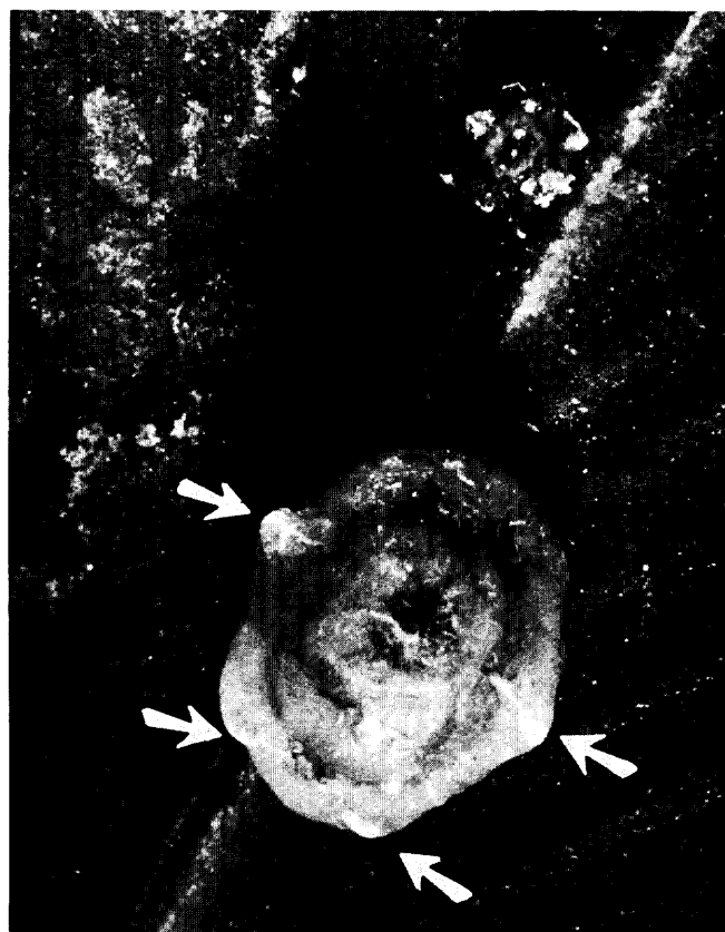
FIG. 2. FEMALE RED WAX SCALE GREATLY ENLARGED (27X). NOTE CONSPICUOUS WHITE BANDS OF POWDERY WAX.

DESCRIPTION: THE WAXY COVER OF THE ADULT FEMALE IS PINKISH TO RED, CONVEX, LONGER THAN WIDE AND WITH TWO CONSPICUOUS PAIRS OF WHITE BANDS THAT EXTEND DORSALLY FROM THE SPIRACULAR AREA (FIG. 2). SIZE: 3.5 - 4.5MM. THE NYMPHS ARE PINKISH IN COLOR.