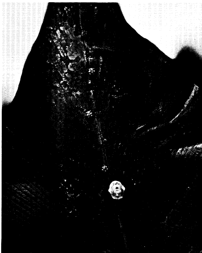
FIG. 1. RED WAX SCALE CEROPLASTES RUBENS MASKELL. ADULT FEMALE (♀) AND NYMPHS ON LEAF (3X).

INTRODUCTION: RED WAX SCALE, CEROPLASTES RUBENS MASKELL (FIG. 1) WAS FIRST FOUND IN AN ORANGE COUNTY NURSERY ON THE FOLIAGE AND STEM OF GREENHOUSE-GROWN AGLAONEMA PICTUM VAR. TRICOLOR AND A. OBLONGIFOLIUM 'CURTISII' BY THE LATE A. C. CREWS, PLANT SPECIALIST, IN NOVEMBER 1955. THIS COLLECTION WAS A NEW FLORIDA AND CONTINENTAL UNITED STATES RECORD OF AN INTRODUCED PLANT PEST. PLANTS FOUND INFESTED WITH RED WAX SCALE IN FLORIDA NURSERIES ARE QUARANTINED UNTIL THE INFESTATION IS ELIMINATED.