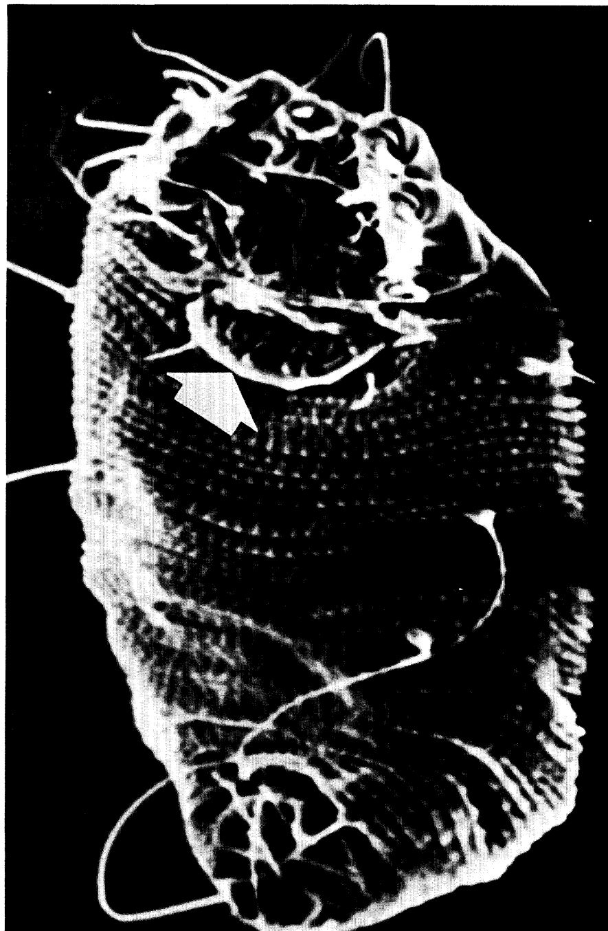
FIG. 4. VENTRAL VIEW OF BUD MITE AT 2000X. ARROW POINTS TO GENITAL FLAP WITH LONGITUDINAL TUBERCLES. DISTORTION PRODUCED BY VACUUM TREATMENT OF MITE.