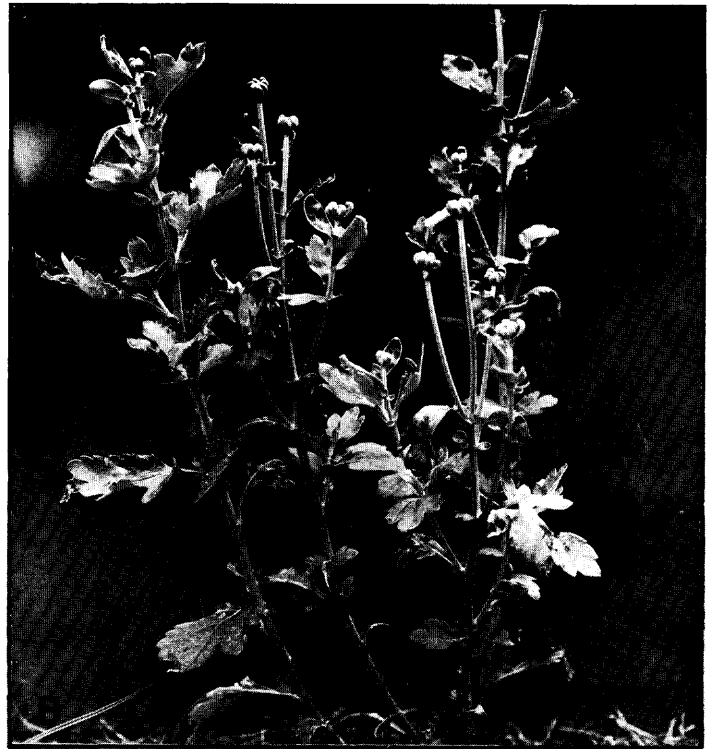
FIG. 2. FOLIAR DAMAGE: A. LEAF WITH MINES AND OVIPOSITION PUNCTURES. B. PLANT SEVERELY INFESTED.