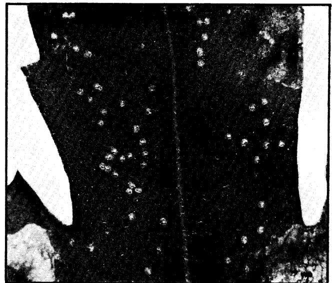
FIG. 4. OVIPOSITION PUNCTURES IN LEAF (GREATLY ENLARGED).