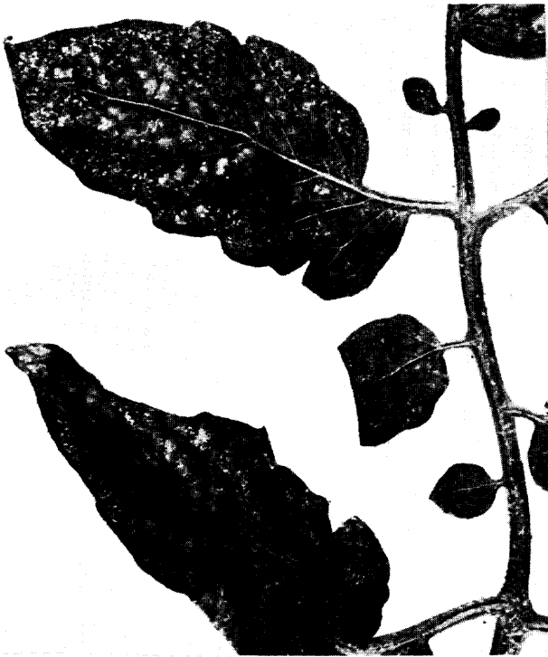
FIG. 1. CHLOROTIC DAMAGE CAUSED BY MITE FEEDING ON TOMATO LEAVES.

ECONOMIC IMPORTANCE : THIS MITE HAS A HIGH BIOTIC POTENTIAL, AND POPULATION DENSITIES MAY RISE SHARPLY DURING DRY, WARM WEATHER. WHERE UNCONTROLLED POPULATIONS OCCUR, MITES MAY BE FOUND HANGING IN TAGS FROM PLANTS, GIVING THE PLANT A REDDISH COLOR. MITES CAUSE LEAVES, SUCH AS THE TOMATO LEAVES IN FIG. 1, TO BECOME CHLOROTIC AND CURL. FIG. 2 SHOWS A CLUSTER OF MITES ON A TOMATO STALK.