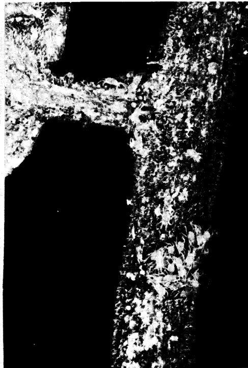
FIG. 2. CLUSTER OF MITES ON TOMATO STALK.