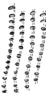
FIG. 3. SKIN STRUCTURE (AFTER KEIFER).