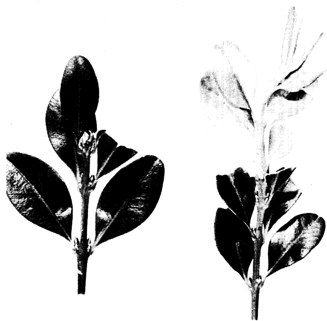
FIG. 5. PHYTOPTUS CANESTRINI NALEPA DAMAGE TO BUXUS MICROPHYLLA .