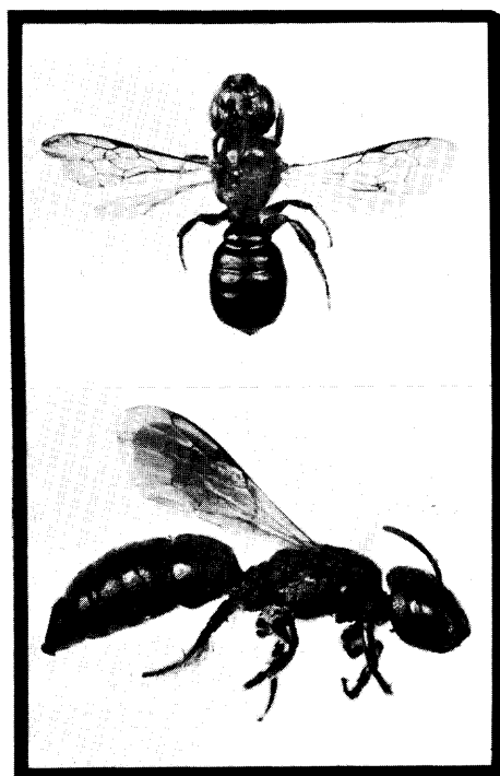
FIG. 1. CERATINA DUPLA (ABOVE, DORSAL VIEW; BELOW, SIDE VIEW)

DISTRIBUTION: CERATINA COCKERELLI IS FOUND THROUGHOUT FLORIDA AND MOST OF THE SOUTHERN COASTAL STATES FROM TEXAS TO GEORGIA (DALY, 1973). SPECIMENS HAVE NOT BEEN REPORTED FROM ALABAMA OR MISSISSIPPI, BUT PROBABLY OCCUR THERE. CERATINA DUPLA IS FOUND THROUGHOUT FLORIDA AS WELL AS MOST OF THE EASTERN UNITED STATES (DALY, 1973).