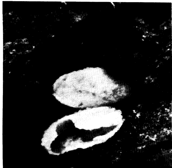
Fig. 4. Kermes sp. Male pupal cases (30X).