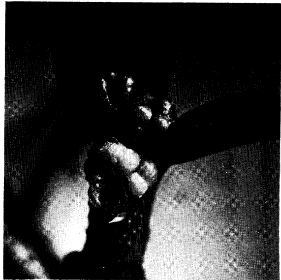
Fig. 2. Kermes kingi Cockerell. Young immature females (3X). (From Hamon et al. 1976).