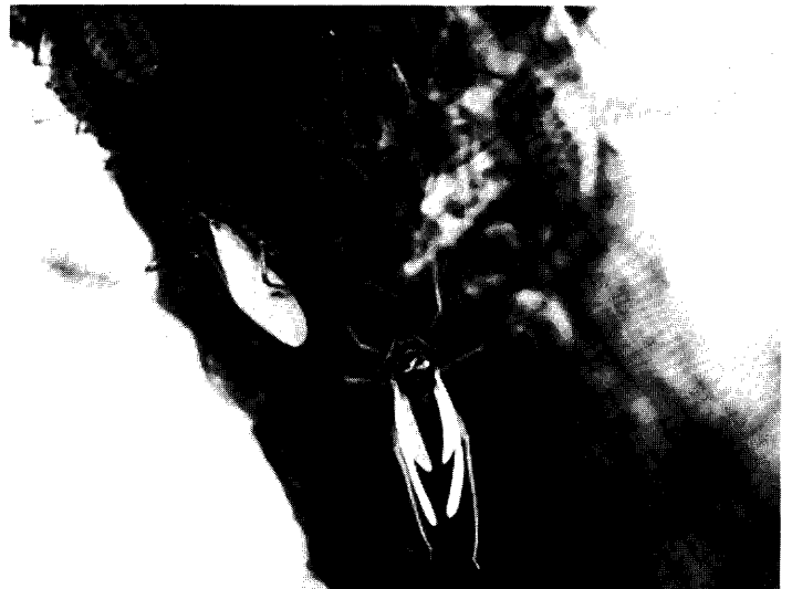
Fig. 2. Longistigma caryae (Harris) feeding on bark of Quercus virginiana (DPI 700555).