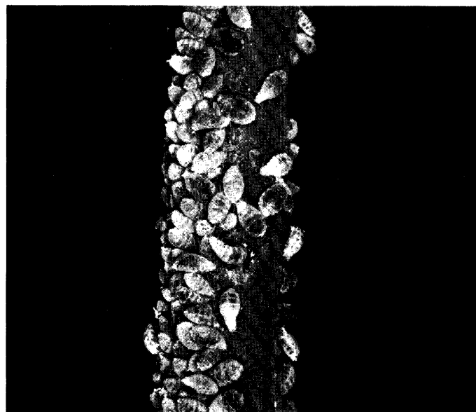
Fig. 3. Sooty mold growing on honeydew from Longistigma caryae (Harris) (DPI 680107).