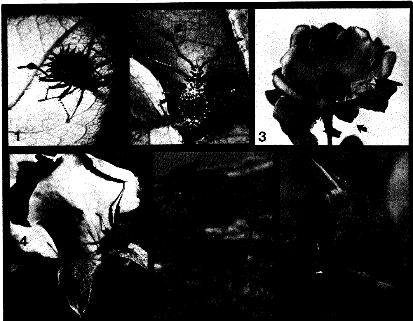
Fig. 1 and 2: Nymphs of Euthochtha galeator (F.); Fig. 3: Rose blossom showing typical uneven development caused by feeding of E. galeator ; Fig. 4: Adult male E. galeator on rose blossom; Fig. 5: Wilting and withering of young rose leaves resulting from feeding by E. galeator ; Fig. 6: Adult male E. galeator feeding on rose bud.

INTRODUCTION: The coreid bug, Euthochtha galeator (Fabricius), is common throughout eastern United States west to the Great Plains (Slater and Baranowski, 1978). The Florida State Collection of Arthropods (FSCA) contains numerous specimens and reports ranging from the northwestern tip of Florida to Key West. It feeds on a variety of wild and cultivated plants, occasionally becoming a pest primarily in dooryard situations where it can injure roses, citrus, and other fruits and ornamentals. Commercial plantings undergoing regular treatment for other insects seldom have a problem with this bug.