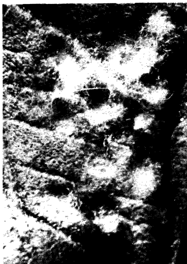
Fig. 1. Woolly whitefly, pupal cases, (X10), DPI#701359

DESCRIPTION: Pupal case yellowish brown to blackish, but usually obscured by a copious amount of secreted grayish white wax threads (fig. 1). These wax threads should not be confused with ribbon-like wax secreted by some other species of whiteflies. The pupal case is about 1.0 mm long by 0.5 mm wide. Dorsum (fig. 2a) of pupal case with metathoracic setae, 8th abdominal setae, and caudal setae stout. Vasiform orifice (fig. 2b) nearly circular, operculum nearly filling orifice, lingula not observable, and 6 to 8 branched setae connected by a membrane arising from the caudal margin. Depending on how the pupal case is mounted on the microscope slide, these branched setae may not be visible. The inability to see these branched setae led to taxonomic confusion between A. floccosus and A. howardi for a number of years. Wax pores (fig. 2c) occur at the base of the marginal teeth.