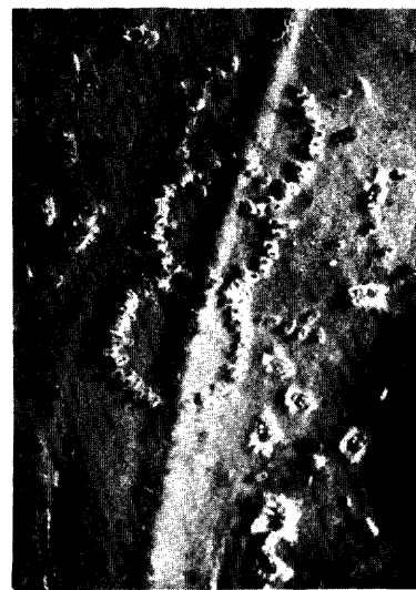
Fig. 3. Woolly whitefly, eggs in circles, larvae, (X30) DPI#701359