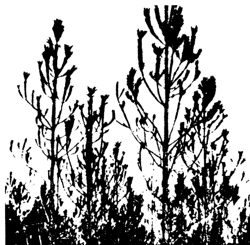
Fig. 3. Characteristic late summer feeding damage by sawfly larvae. DPI Neg. No. 702906-21.