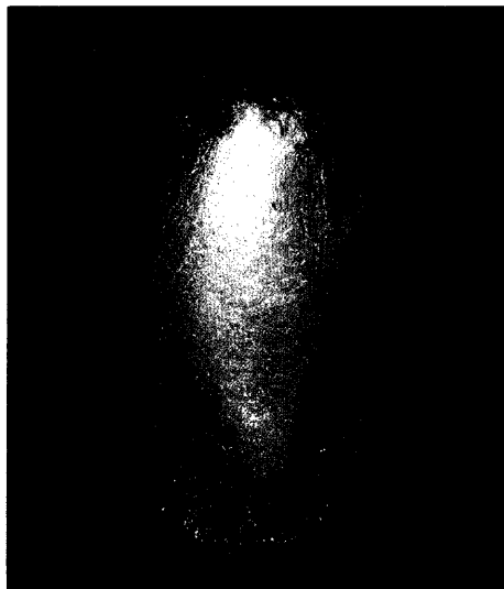
FIGURE 6: Cactoblastis cactorum , cocoon.