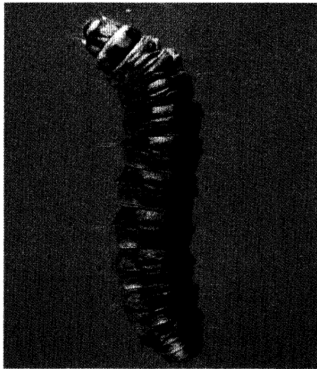
FIGURE 3: Melitara prodenialis , mature larva.