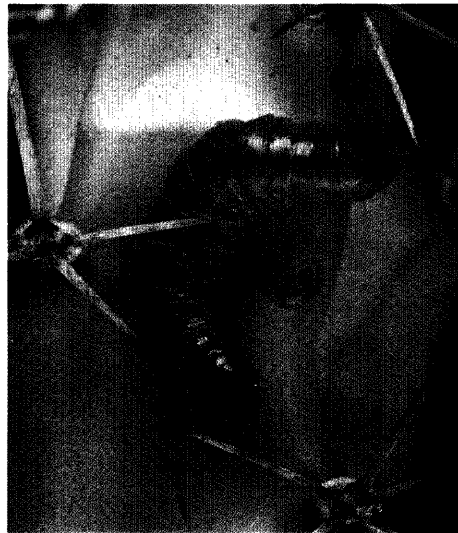
FIGURE 4: Rumatha glaucatella , mature larva.