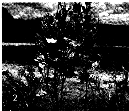
Figures 1-3. 1) Adult Schistocerca americana (Drury); 2) nymphs of S. americana on citrus tree near Dade City in Pasco County, June 1991; 3) nymph of S. americana .