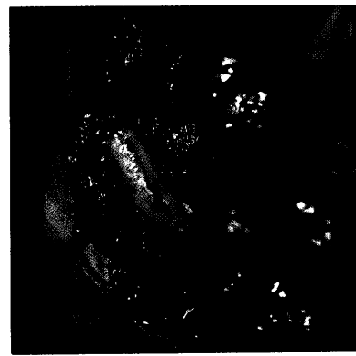
Fig. 2. Blueberry maggot larva

TAXONOMY: Bush (1966) recognized a Rhagoletis pomonella species group and delimited four very similar species based on morphology, host plants, distribution, phenology and cross-breeding experiments: R. mendax , R. pomonella (Walsh) (apple maggot), R. cornivora Bush (dogwood berry maggot) and R. zephyria Snow (snowberry maggot). Genetic studies employing electrophoretic analysis of protein variation have confirmed these species (Berlocher and Bush 1982, Feder et al. 1989).