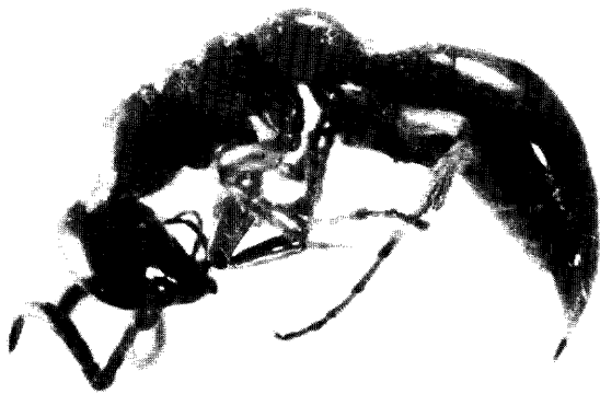
Fig. 1. Methoca ♀.

BIOLOGY: Female tiphids burrow into the ground to oviposit on white grubs or, rarely, tiger beetle (Coleoptera: Cicindelidae) larvae. They are considered to be the most efficient and abundant of the white grub parasite complex (Davis 1919). Three species of Tiphia were introduced into the eastern U.S. for control of the Japanese beetle (Davis 1919), but only T. popilliavora Rohwer is established. Male Myzinum often form swarms of hundreds of individuals flying about bushes probably in a mating frenzy. The females can sting when handled, but are not aggressive.