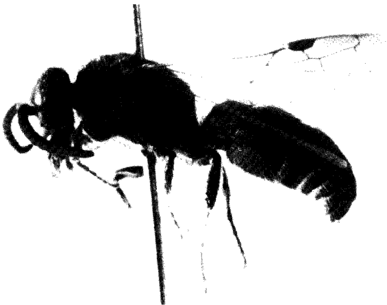
Fig. 3. Paratiphia ♀.