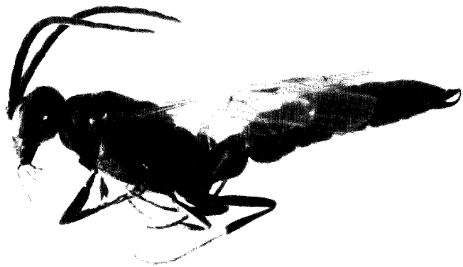
Fig. 2. Methoca ♂.