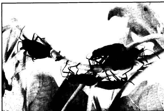
Fig. 1. Colony of Spartocera batatas on sweet potato.

DESCRIPTION: Spartocera batatas belongs to the tribe Spartocerini (=Corecorini of Baranowski and Slater (1986) and Blatchley (1926)) (Froeschner 1988). Characteristics of the tribe include absence of spines and leaf-like dilations on the legs and antennae (including antennal tubercles), short mouthparts (not extending past the midcoxae) and square head with a deep groove between the antennal sockets. Within the Spartocerini, the genus Spartocera (=Corecoris) can be recognized by the irregular anastomosing veins on the membranes of the forewings and by the absence of lateral toothlike projections on the pronotum (Alayo 1967; Baranowski and Slater 1986). Adult S. batatas (Fig. 2) are large insects, 18-23 mm in length. They are entirely dark brown. Lateral (humeral) angles of the pronotum are rounded and without teeth, and the lateral margins of the pronotum are not expanded. Newborn nymphs are red. They soon lose their bright color and become very dark brown except for the head, the lateral angles of the pronotum and the expanded lateral edges of the abdomen, which are marked with bright red-brown spots. Eggs are shaped like tiny fat sausages, and their color varies from gold to brown with age.