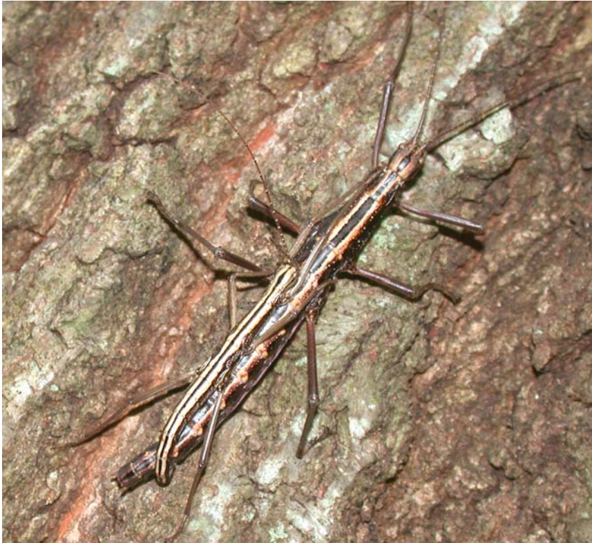
Fig. 1. Male and female of Anisomorpha buprestoides as usually seen. The female is the larger of the two.

INTRODUCTION: The most common stick insect in Florida is Anisomorpha buprestoides (Stoll), the so-called twostriped walkingstick. Other names applied to it (and to stick insects in general) include devil's riding horse, prairie alligator, stick bug, witch's horse, devil's darning needle, scorpion, and musk mare (Caudell 1903). The last common name is particularly apt as this species is capable of squirting a strong-smelling defensive spray that is painfully irritating to the eyes and mucous membranes (Gray 1835; Meinwald et al. 1962; Eisner 1965; Stewart 1937; Hatch et al. 1993; Paysse et al. 2001; Dziezyc 1992). Several recent inquiries about such incidents prompted the preparation of this circular.