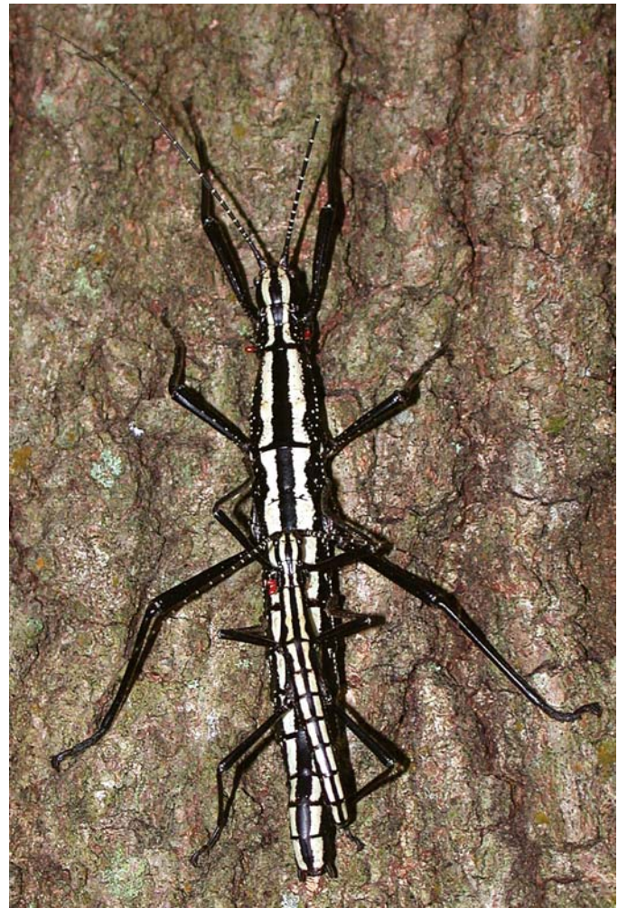
Fig. 2. Male and female of Anisomorpha buprestoides , Ocala National Forest color form.

Eisner (1965) reported, “The secretion is produced and stored in two elongate, sac-like glands situated in the thorax and opening just behind the head.” Happ et al. (1966) presented detailed information on the structure of the glands. The glands open in notches (Fig. 3) at the anterolateral angles of the pronotum (Littig 1942). The glands are functional from birth and Eisner (1965) reported newly-hatched nymphs successfully repelling attacks by single ants. Meinwald et al. (1962) identified the active