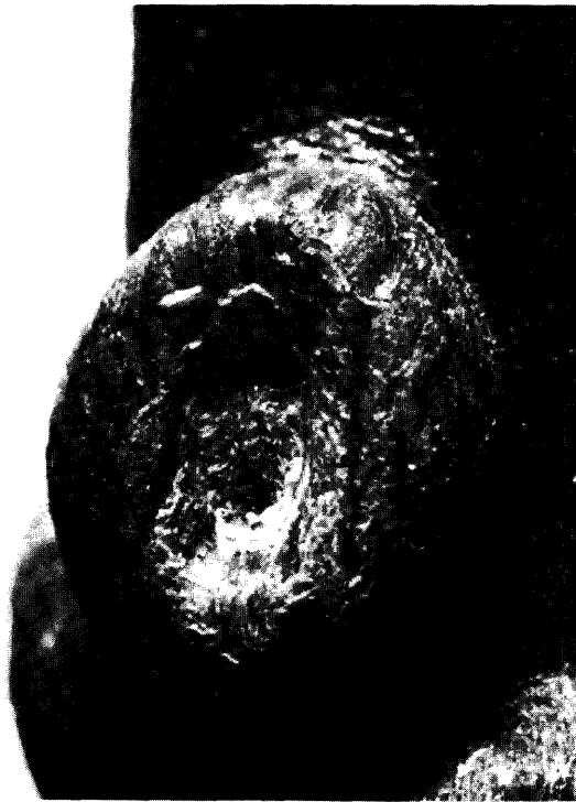
Fig. 3. Oleander pit scale, in a deep pit (X6)