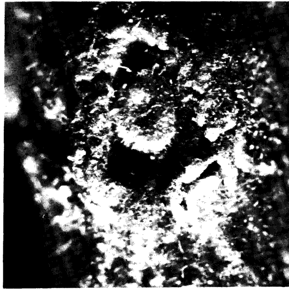
Fig. 2. Oleander pit scale in a shallow pit (X6)