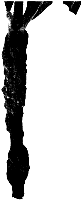
Fig. 4. Damage caused by oleander pit scale on Nerium sp. (life size)