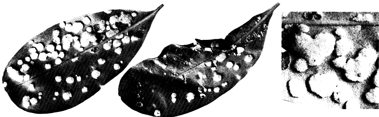
Fig. 1. Rapanea quianensis infested with Nothopoda rapanae K.