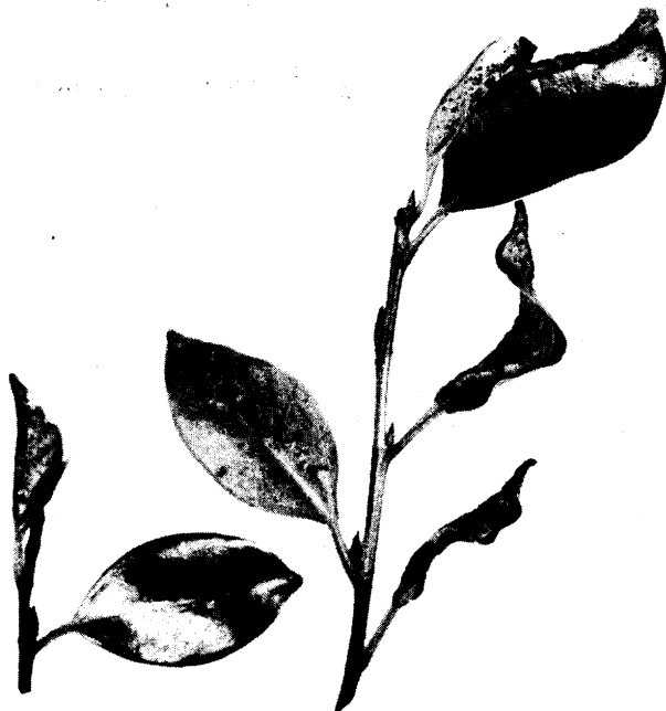
FIG. 1. LEAVES OF FICUS RETUSA DAMAGED BY CUBAN-LAUREL THRIPS.

ECONOMIC IMPORTANCE: ADULT THRIPS FEED ON THE TENDER, LIGHT-GREEN LEAVES, CAUSING SUNKEN REDDISH SPOTS ALONG THE MIDRIB (FIG. 1). TIGHT CURLING OF THE LEAF IS CAUSED BY THE DEVELOPING COLONIES OF IMMATURE THRIPS. THE CURLED LEAF BECOMES HARD AND TOUGH, THEN GRADUALLY YELLOWER AND BROWNER, AND DROPS DURING WINDY, RAINY WEATHER. MOST OF THE OUTSIDE LEAVES OFTEN WILL DROP CAUSING AN UNSIGHTLY LITTER ON LAWNS AND PAVEMENT. THE THRIPS CAN BE VERY ANNOYING AND OFTEN INADVERTENTLY BITE WHEN THEY DROP ONTO PEOPLE.