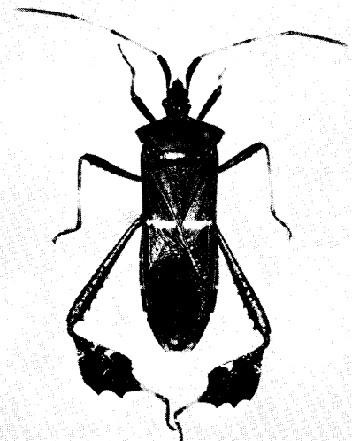
FIG. 3. ADULT OF LEAFFOOTED BUG, LEPTOGLOSSUS PHYLLOPUS (L.)