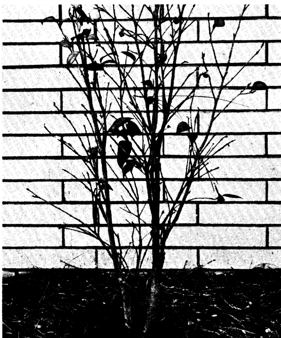
FIG. 2. SHRUB WITH SEVERE TEA SCALE INFESTATION.

HOSTS: AUCUBA JAPONICA THUNB. (JAPANESE AUCUBA); CALLISTEMON SP. (BOTTLEBRUSH); CAMELLIA JAPONICA L.; CAMELLIA SASANQUA THUNB.; CAMELLIA SINENSIS L. (TEA PLANT); CITRUS LIMON BURM.F. (LEMON); CITRUS PARADISI MACF. (GRAPEFRUIT); CITRUS RETICULATA BLANCO (SATSUMA); CORNUS SP. (DOGWOOD); EUONYMUS SPP. (BURNING BUSH, STRAWBERRY BUSH); EURYA JAPONICA THUNB.; FORTUNELLA SP. (KUMQUAT); GARDENIA SP. (CAPE JASMINE); GORDONIA SP. (LOBLLOLY BAY); ILEX AQUIFOLIUM L. (ENGLISH HOLLY); ILEX CASSINE L. (DAHON HOLLY); ILEX CORNUTA LINDL. & PAX. (CHINESE HOLLY); ILEX CORNUTA 'BURFORDII' (BURFORD HOLLY); ILEX LATIFOLIA THUNB. (LUSTERLEAF HOLLY); ILEX OPACA AIT. (AMERICAN HOLLY); ILEX ROTUNDA THUNB.; ILEX VOMITORIA AIT. (YAUPON); MALPIGHIA SP. (MALPIGHIA); MANGIFERA INDICA L. (MANGO); MELALEUCA LEUCADENDRA L. (CAJEPUT, PUNK TREE); OSMANTHUS FRAGRANS LOUR. (SWEET OLIVE, TEA OLIVE); PONCIRUS TRIFOLIATA RAF. (ORANGE, TRIFOLIATE); SENECIO CONFUSUS BRITT. (MEXICAN FLAME VINE); SYMPLOCOS TINCTORIA L. (COMMON SWEETLEAF).