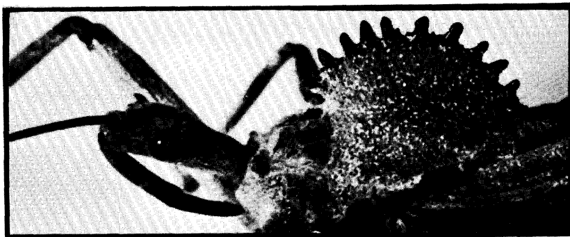
FIG. 7: ADULT ARILUS CRISTATUS (L.) (ORIGINAL) 5.5X; LATERAL VIEW, HEAD & PRONOTUM.

SYNONYMY: WYGODZINSKY (1949) LISTED THE FOLLOWING SYNONYMS: GENERA: CIMEX LINNAEUS, PRIONOTUS LA PORTE, AND PRIONIDES UHLER; SPECIES: DENTICULATUS WESTWOOD, NOVENARIUS (SAY), AND PATULUS (WALKER).